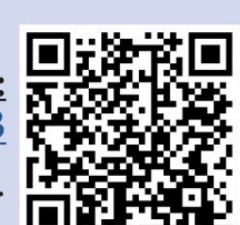
Fig.2: First international conference on telechaplancy

Registration: https://bit.ly/3PAGL1B Attendance is free of charge.