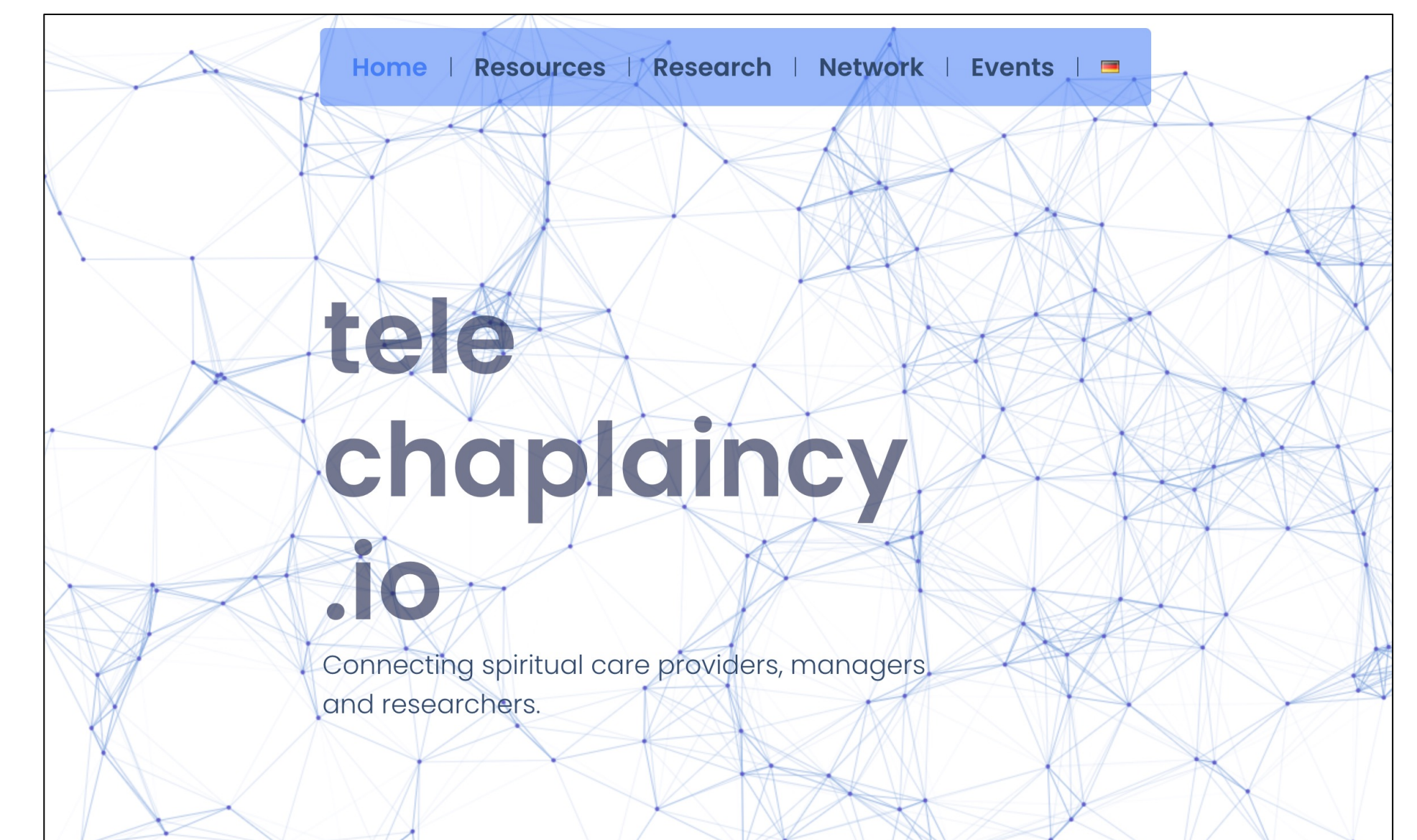
Fig.3: Web portal launched as part of phase 1, connecting scholars and practitioners in Germany and North America. It has received >11'000 visits, and is ranked #1 on Google for “telechaplancy”.